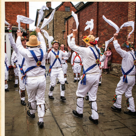
Bromyard town plays host to the many dance displays