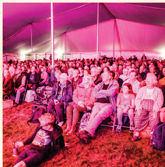
We welcome 1000's individuals each year